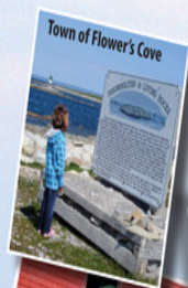
Town of Flower's Cove