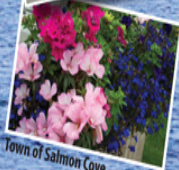
Town of Salmon Cove

Judges will be out traveling the province this summer. Evaluations will begin Monday, July 6, 2009.