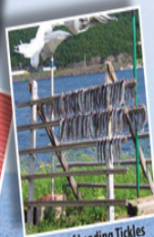
Town of Trout River